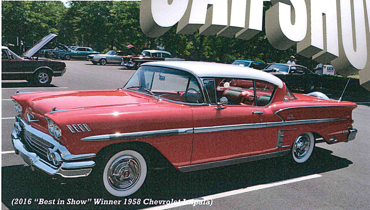
(2016 "Best in Show" Winner 1958 Chevrolet Coupe)

To Benefit The Arthur C. Luf Children's Burn Camp To date this car show has raised $190,457.00!